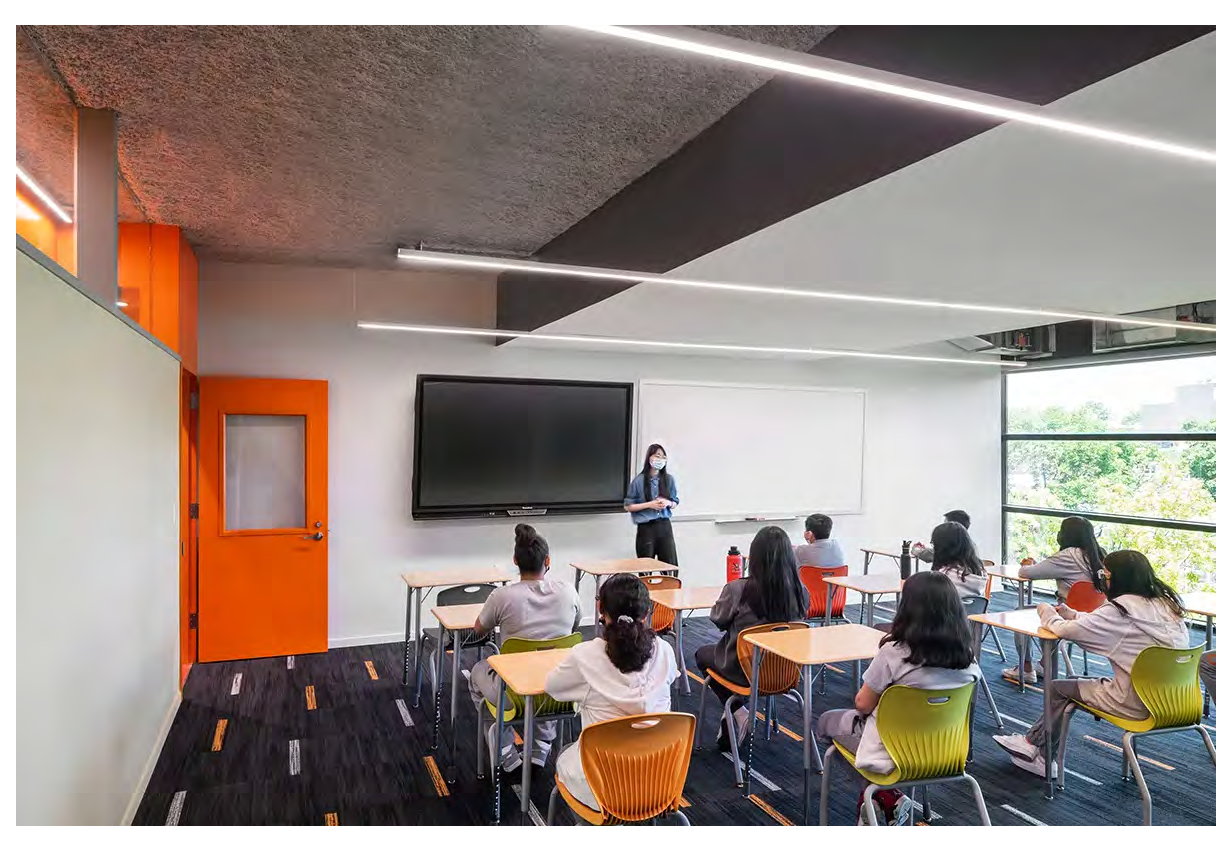
View of learning hub classroom.

own wing at one end of the floor and a commons with a raised platform on one side that can be used as a small stage. On the floor above, this wing is for eighth graders and its commons is lined on three sides with lockers that give the students a hint of the high school experience.