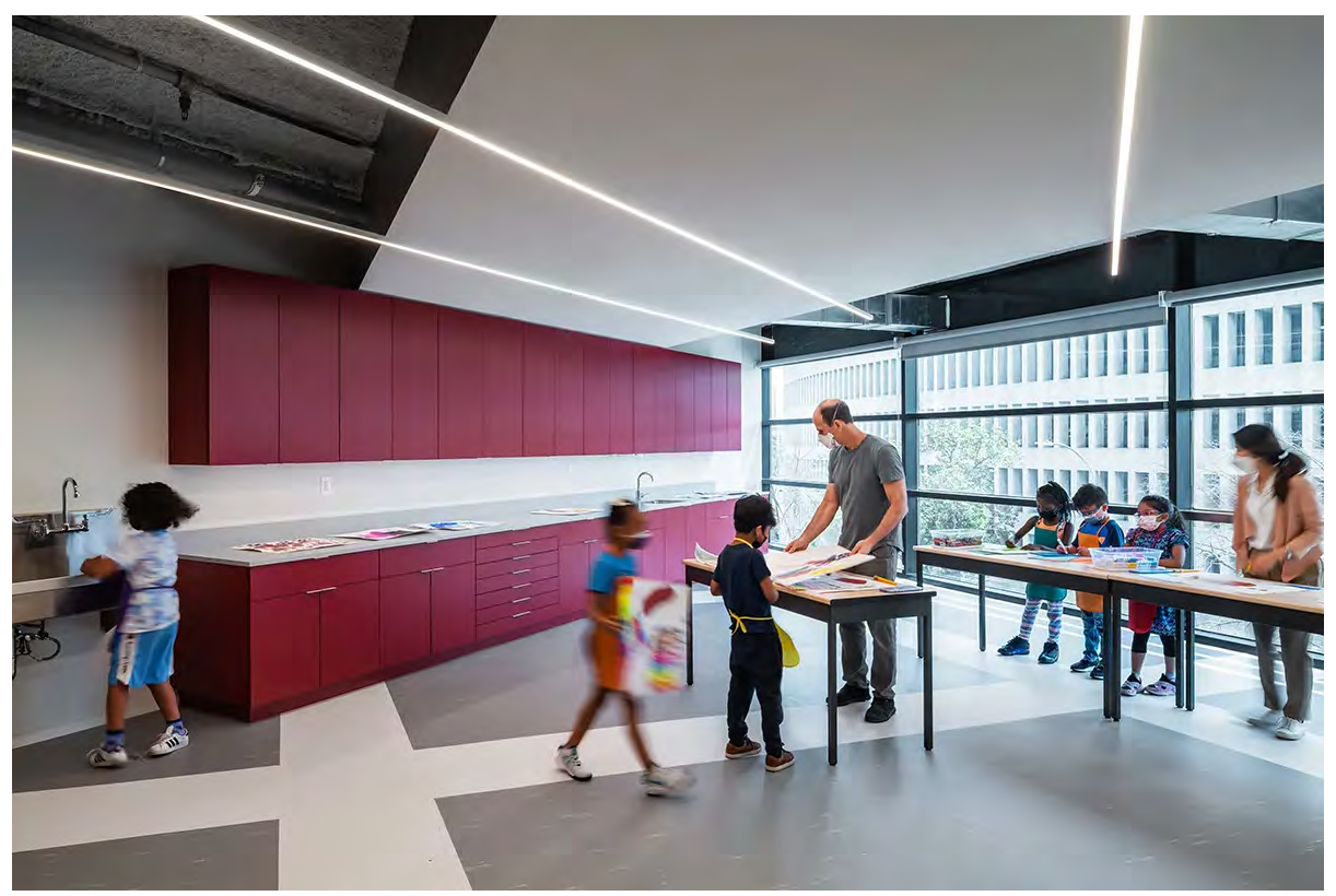
Learning spaces located around the perimeter of the building are flooded with natural light.

Each of the upper floors of the school offers about 35,000 square feet, which is ideal for offices but difficult for a public charter school serving elementary and middle-school