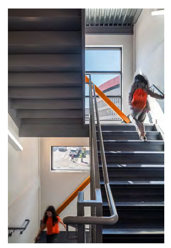
Stairwell connecting the classrooms located on the

CQA, which moved into its new home last fall, now has 800 students in the building and will add another 100 next year. Faculty and staff account for another 110 people. Kindergarten and elementary school classes occupy the third floor, while the middle school is on the fourth. The layout of each floor is near-identical with four commons on each, though the décor and fit-outs vary. The Central Commons on each level has a green carpet that resembles a lawn and a recessed blue ceiling that alludes to the sky. Used for non-traditional teaching, as well as social gathering and relaxing between classes, this space is fitted with built-in seating and a large white wall where