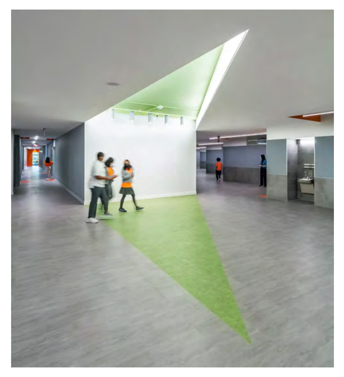
View of the Crossroads Commons near the school's main stairwell. This area will provide access to a future "gym bridge" leading to an adjacent building.